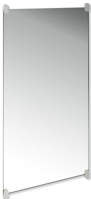
Plate glass mirror 801.01.300